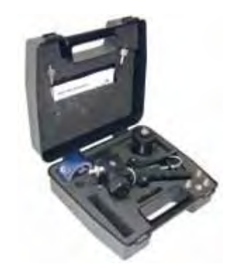
Pneumatic and hydraulic test kit