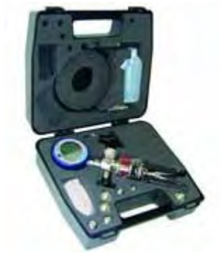
Hydraulic test kit